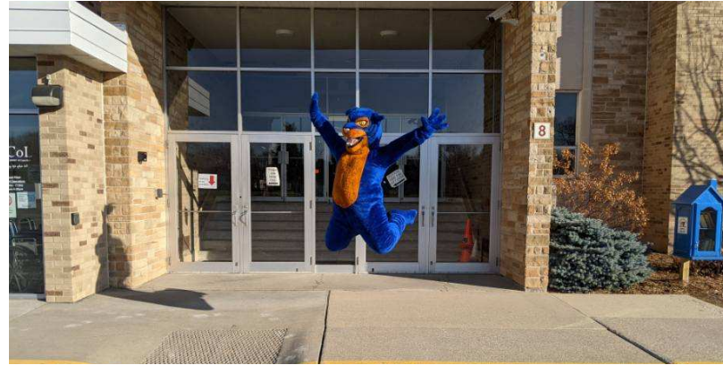
The TRS Bobcat jumping for joy in front of his new home in Appleton! See more views of TRS-Appleton below!

Bobcat pride is evident in all TRS locations. To be able to share our passion with the surrounding community is something TRS is grateful for.